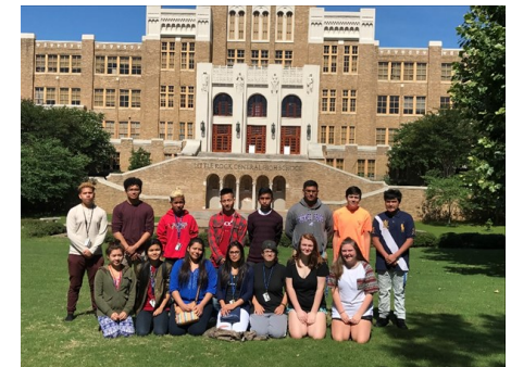
2017 MUA students pictured in front of Little Rock Central High School during a field trip