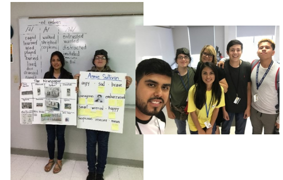
Students displaying work during English class