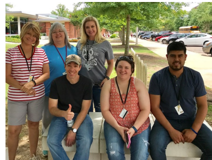
MUA Teachers Summer 2017